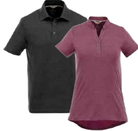
CONCORD SHORT SLEEVE POLO M 16611 W 96611