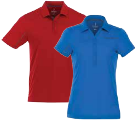
WILCOX SHORT SLEEVE POLO M 16309 W 96309