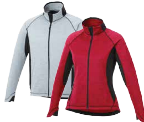
LANGLEY KNIT JACKET M 18123 W 98123