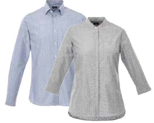
HUNTINGTON THREE QUARTER SLEEVE M 17601 W 97601