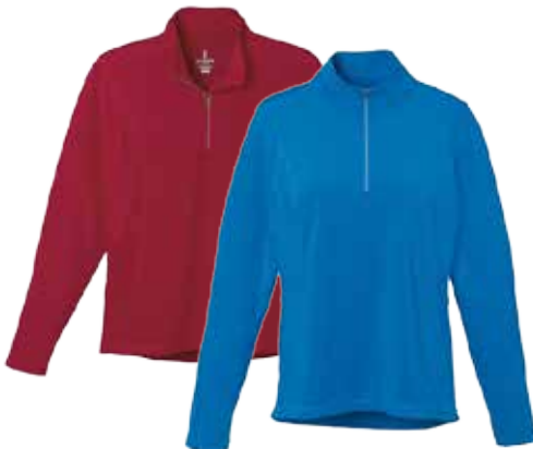
CALTECH KNIT QUARTER ZIP M 17807 W 97807